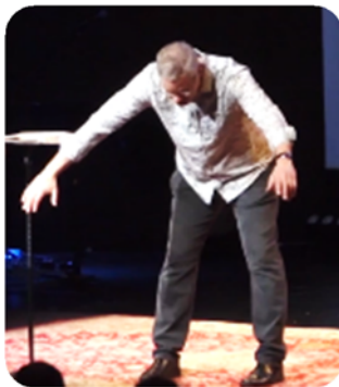
Straddle the board

Now, hopefully I've fallen and I just straddle the board like this, now how